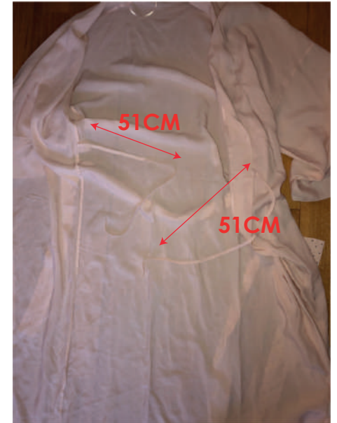
LARGO CORDONES INTERIORES