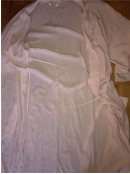
INNER PIPPING 0,7 CM WIDTH CORDÓN INTERIOR TIPO EMBUDO SPAGUETTI 0,7 CM ANCHO